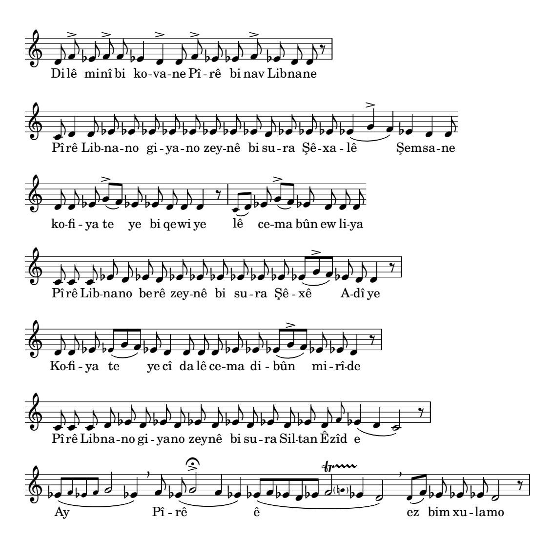
Musical transcription 7. Merwanê Xelîl, Qewlê Kofa, Heavy Kubrî.

In both versions of Qewl\hat{e} Kofa the first part of the stanza ( Dil\hat{e} min\hat{i} bi kovan e / P\hat{i}r\hat{e} bi nav Libnan e), uttered within one breath group, is composed by two short melodic lines nearly identical on the lower part of the ambitus. It is followed by a recitative part up to the refrain (for the heavy kubr\hat{i} ) or up to the next stanza (for the quick kubr\hat{i} ). Both versions end this second part with a descending curve: on Do for the heavy kubr\hat{i} , and on Re or Do for the quick kubr\hat{i} . With the quick kubr\hat{i} these two parts are repeated three times before the refrain, while with the heavy one, the refrain is added each time. The refrain can be divided in two parts in both versions: a first melodic part (on Ay p\hat{i}r\hat{e} ) with melismas on few syllables, and a second part (on ez bim xulamo), which is recitative on few notes.